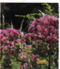
Joe Pye Weed